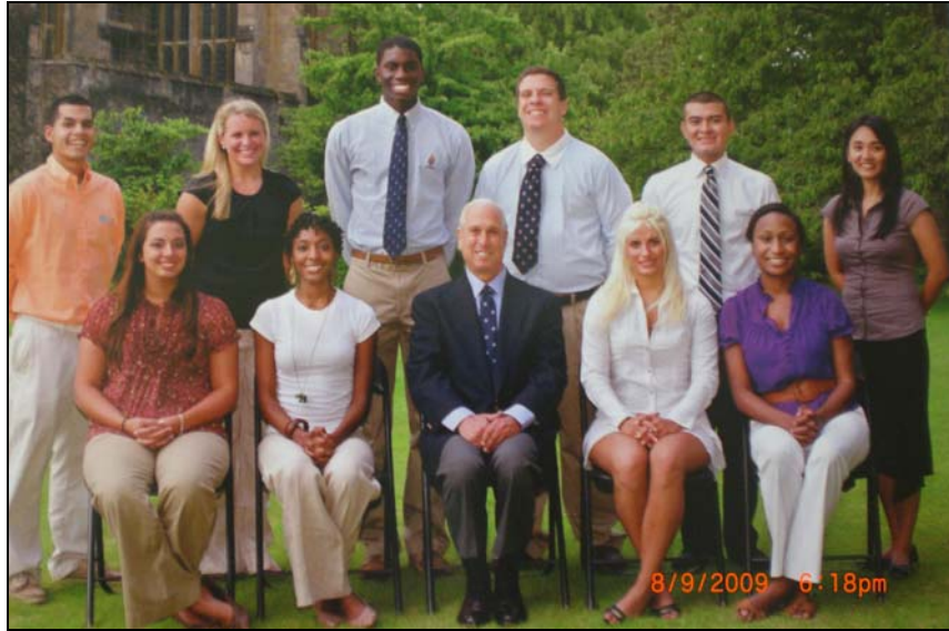
-- GMU Oxford Global Law Programme (Summer 2009) -- New College, Oxford University