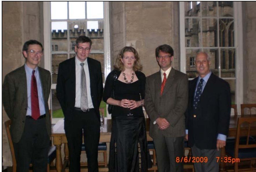
-- Oxford Global Law Faculty --